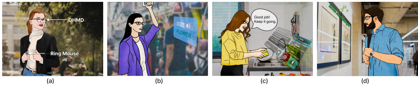
Figure 2: Assistance applications, (a) a common setup consisting of OHMD and subtle gesture (e.g., ring) interaction, (b) microlearning on the go, (c) messaging during daily activities, and (d) in-context experience documentation

Information Presentation and Interactions. Heads-up displays must balance delivering just-in-time information while minimizing distractions, particularly for secondary information [15]. My dissertation [5, 6] introduced strategies leveraging visual perception, including paracentral displays [10], graphical formats [14], and luminance adjustments [12]. These techniques, validated through user studies, reduce interference with primary tasks. Additionally, collaborative work extended these designs to support bi-directional interactions, such as ParaGlassMenu [4], which integrates AR smart glasses and subtle input devices to enable effective, socially aware interactions.